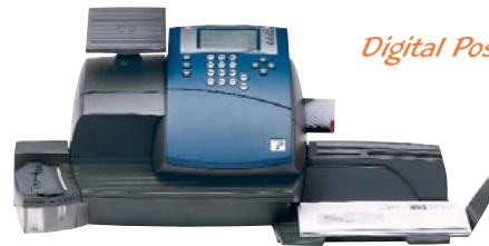
Digital Postage Meters