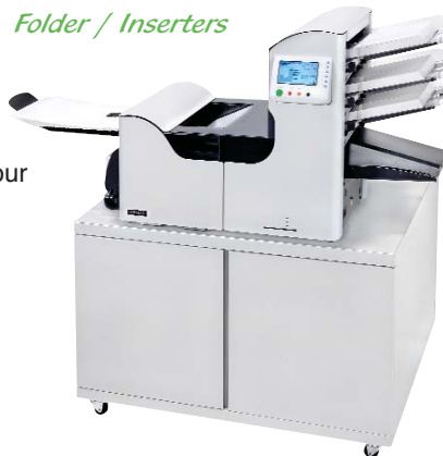
Folder / Inserters