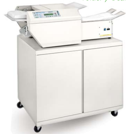
Folder / Sealers