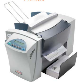
Direct Impression Printers